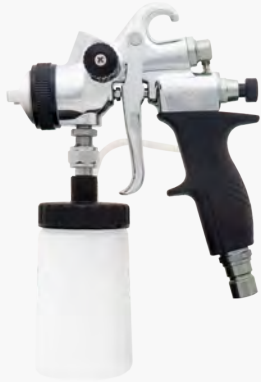
4200 T-PRO BOTTOM FEED APPLICATOR