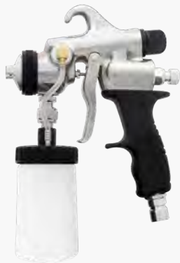
TAN7350 BOTTOM FEED APPLICATOR

Available as part of a system or on its own